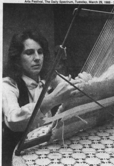
Local artist works on loom